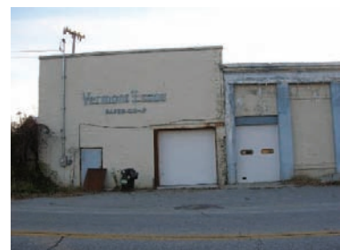
Vermont Tissue in North Bennington was a site in the 2008 BCRC program