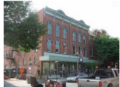
The second-floor offices of the BCRC since 2007, located in Bennington

The Challenges for Change legislation, which was approved by the Vermont Legislature this year, is an outgrowth of Act No.68 of the Acts of the 2009 adjourned session. A primary driver of the Challenges for Change is closing the gap between available revenue and expenditures. The legislation creates outcome driven changes in services and performance with reduced state funding through efficiencies, reductions, and consolidations. State agencies and departments are specifically addressed together with related outcomes.