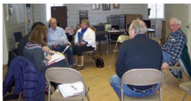
BCRC staff works closely with parties on a variety of regional issues

contracts that will go into effect on February 1, 2010. BCRC and BCIC are working together to implement measures consistent with the legislation. Among the outcomes of the legislation is to be increased employment and income, as well as state-of-the-art telecommunications infrastructure. The legislation also sets forth a directive that regional service delivery be effective, efficient, and improved for the benefit of Vermont residents, businesses, and visitors.