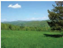
A summer vista on a rural road in Pownal