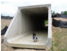
The new White Rocks Trail pedestrian tunnel