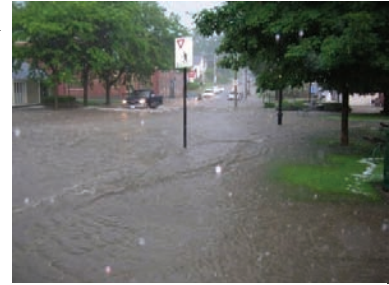
Flooding in downtown Bennington