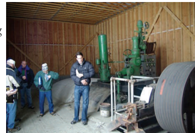
A meeting on potential hydro-power taking place at the Pownal Dam.