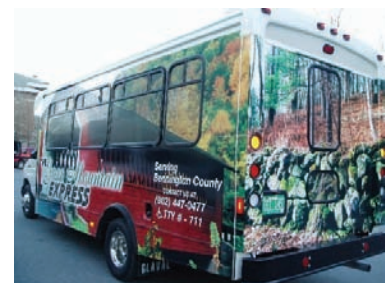
The Multi-Modal Facility will feature covered parking for GMCN buses

The BCRC is assisting the Town of Bennington in obtaining designated FTA earmark funds for the purpose of renovating the existing public transit facility in Bennington into a multi-modal facility. This involves coordination with the county public transit provider, the Green Mountain Community Network, who presently owns the property.