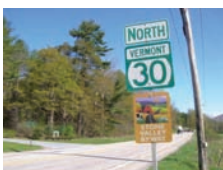
The new Stone Valley Byway signs are up